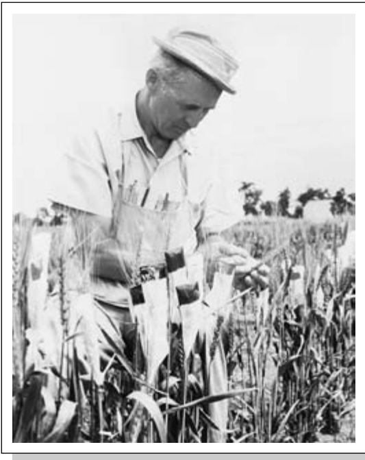
Figure 1 Dr Norman Borlaug working in a wheat crossing block.

late Japanese industrialist, Ryoichi Sasakawa, in addressing some of the same agricultural issues dear to Dr Borlaug. In 1984, Mr Sasakawa persuaded Dr Borlaug to come out of retirement to join them to vigorously pursue food production in Africa. This alliance gave birth to the Sasakawa Africa Association, presided over by Dr Borlaug. In conjunction with Global 2000 of The Carter Center, Sasakawa-Global 2000 was born, with a mission to help small-scale farmers to improve agricultural productivity and crop quality in Africa. Without wasting time, Dr Borlaug selected an initial set of countries in which to run projects. These included Ethiopia, Ghana, Nigeria, Sudan, Tanzania, and Benin (Figure 3). The crops targeted included popular staples such as corn, cassava, sorghum, and cowpeas, as well as wheat. The most spectacular success was realized in Ethiopia, where the country recorded its highest ever yield of major crops in the 1995–1996 growing season.